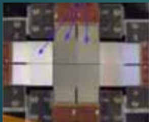
X-ray CCD camera onboard satellite